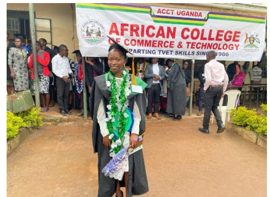
Congratulations to P who has graduated from College and is now job hunting!

The future for SEDCU is bright and we have no lack of ambition, but of course all this will only be possible thanks to the continuing generosity of our sponsors and donors!