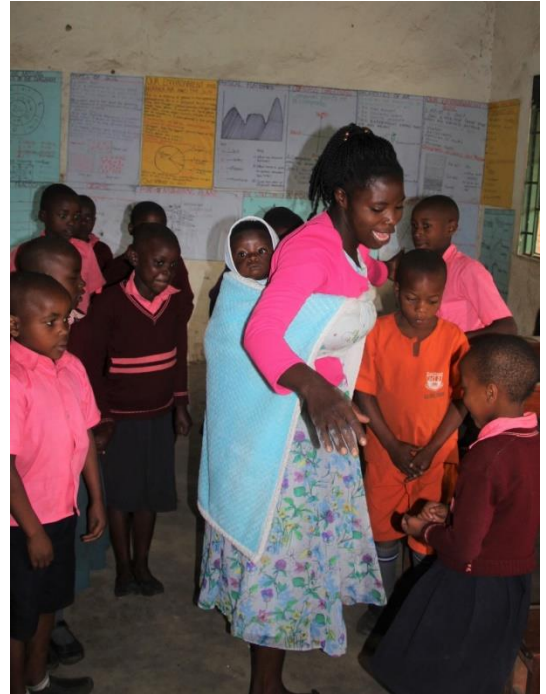
MCJS teacher (and future pupil?!) in class P3.

“We are happy and thankful that the final touches were installed by July 2023, where throughout the mentioned challenges, the project is finally declared complete. As expected, the bio-gas is not meant to cook big volumes of meals for bigger numbers of people but can cook small volumes including boiling some water and other simple cooking tasks. The main reason for the system was to improve the sanitary block from being smelly hence conducive environment therein, by extracting the gas for another usage. Many thanks to SEDCU and supporters for such a great achievement!”