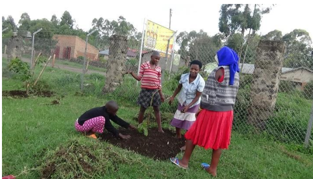
Tending an avocado tree

Children with visual and hearing impairment have been actively involved in the maintenance of trees planted in the school compound, cleaning the school environment, and working on the newly created school farm, funded by another charity Sustain for Life. There has been a continued focus on improving the nutrition of the meals provided to the children, partly relying on the produce they grow.