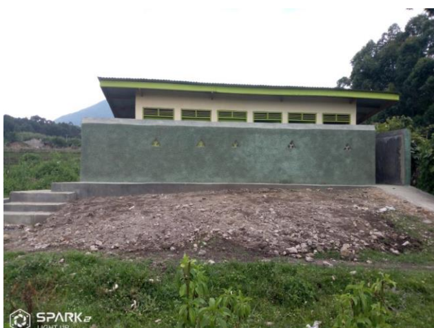
New Bio-toilet with Bio-gas system as fully supported by SEDCU 2019/2020 (Front view)

In Autumn 2019, SEDCU enabled a start to be made on replacing the existing woefully inadequate latrines by a new, much larger, Sanitary Block which will make use of a modern bio energy septic tank. SEDCU has funded the whole of this building whose construction was completed in early 2020; however, the finalisation of the septic tank /biogas system was also held up by the national lockdown.