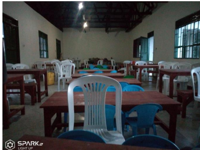
The new dining room

In Autumn 2019, SEDCU enabled a start to be made on replacing the existing woefully inadequate latrines by a new, much larger, Sanitary Block which will make use of a modern bio energy septic tank. SEDCU has funded the whole of this building whose construction was completed in early 2020; however, the finalisation of the septic tank /biogas system was also held up by the national lockdown.